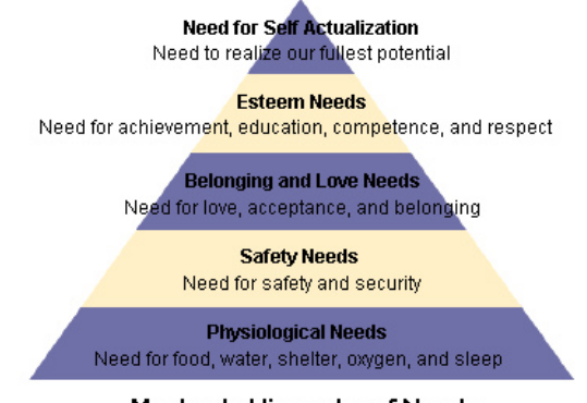
Maslow's Hierarchy of Needs

When working with youth (and adults), we must identify the learning goals of the activity and create an environment that makes those goals achievable. For